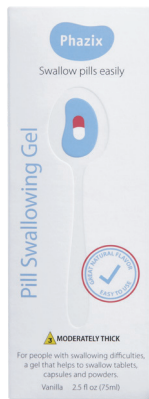
2.5 fl oz tube