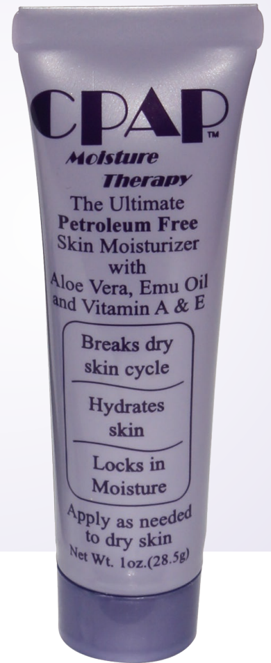
Item# CAP6100L 1oz Tube 18/case