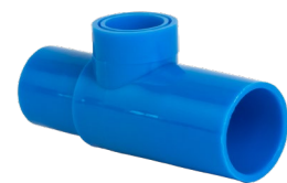
15mm Tee Adapter