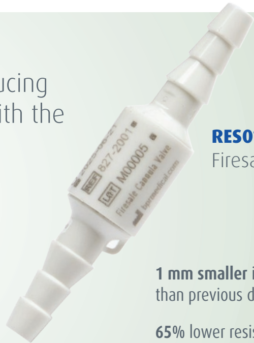
RES010 Firesafe Valve