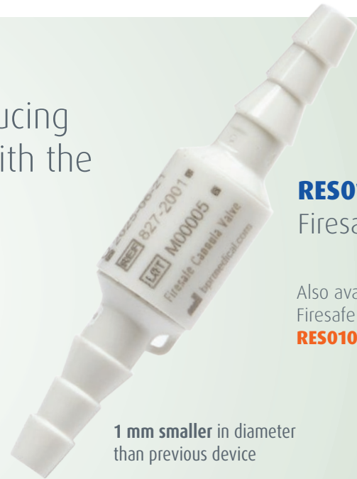
RES010F-20 Firesafe Valve

Also available — Firesafe Nozzle RES010FND